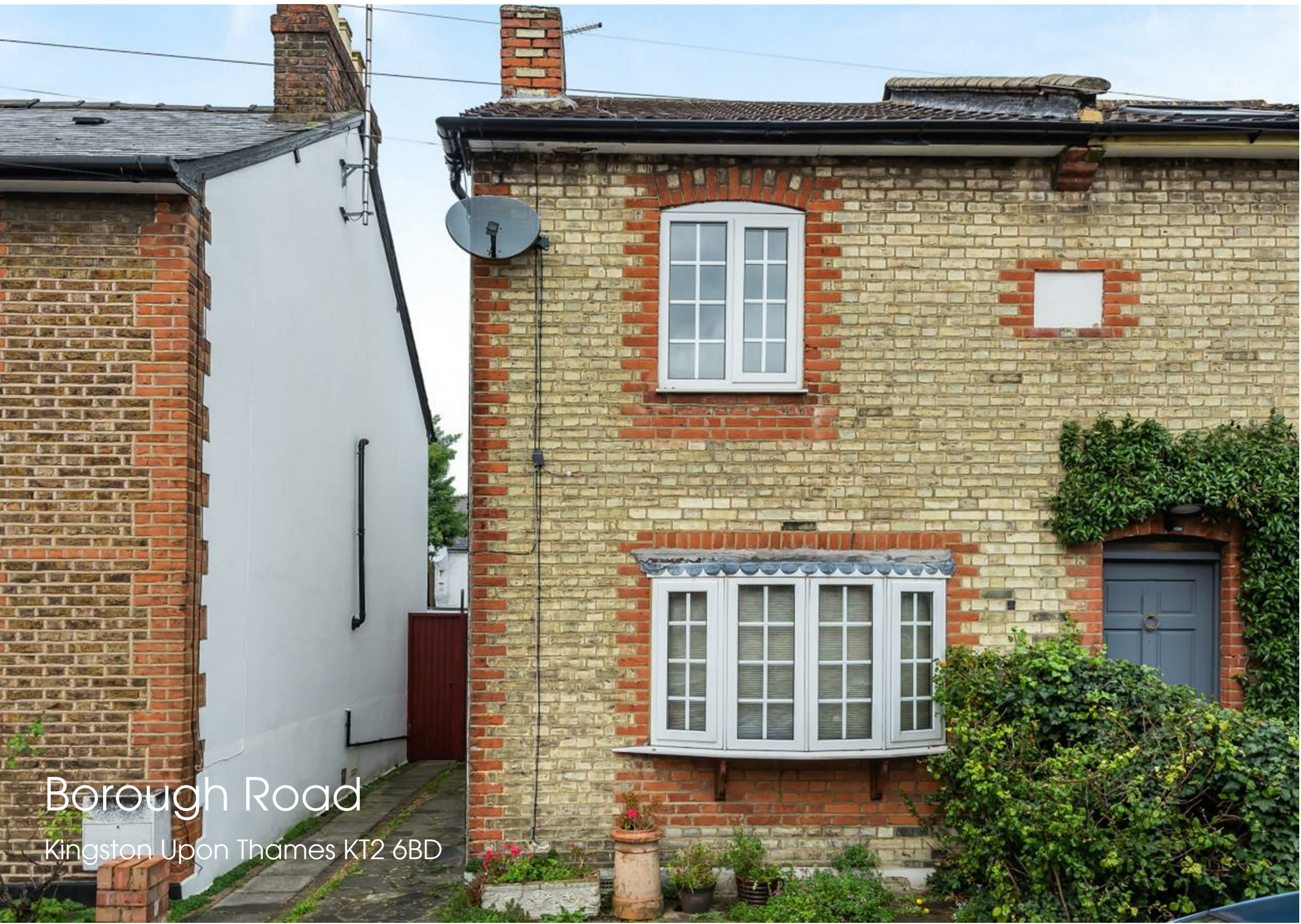
Borough Road Kingston Upon Thames KT2 6BD

34 Richmond Road Kingston upon Thames Surrey KT2 5ED www.gibsonlane.co.uk Tel: 020 8546 5444